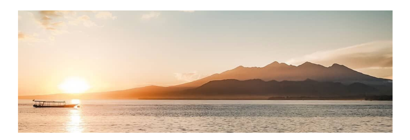
Eco Travel Designed with Love & Passion

The Gili Islands consists of three islands: Gili Trawangan, Gili Meno and Gili Air. Most of the locals depend on tourism, meaning that the majority of restaurants and hotels are owned by locals. There are many different activities besides swimming and sunbathing on Gili Air and the surrounding islands. Ask us for whatever you would like to experience or explore - we can help you with anything.