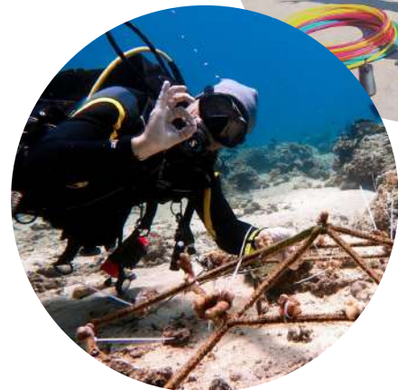
@3wdive @sorayafoundation @gilisharkconservation