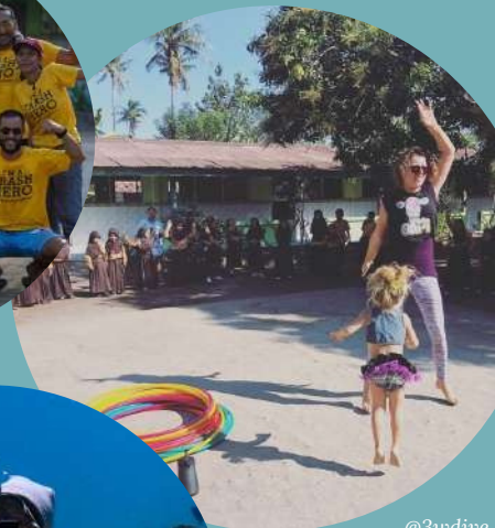
@3wdive @sorayafoundation @gilisharkconservation