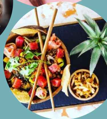
@giliblisslove_giliair @musa.cookery @legendbargiliair