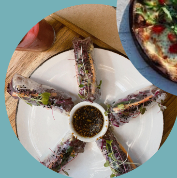
@papayagili @mamapizzaindo @pachamamagiliair