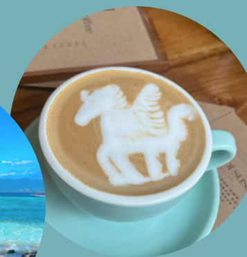
@scallywags_resort @pituqco @kopisusu_giliair